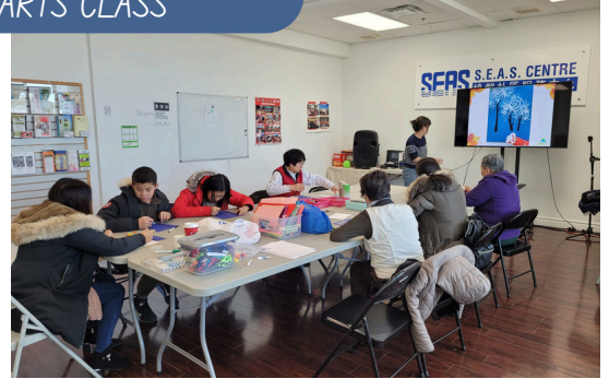
CREATIVE ARTS CLASS