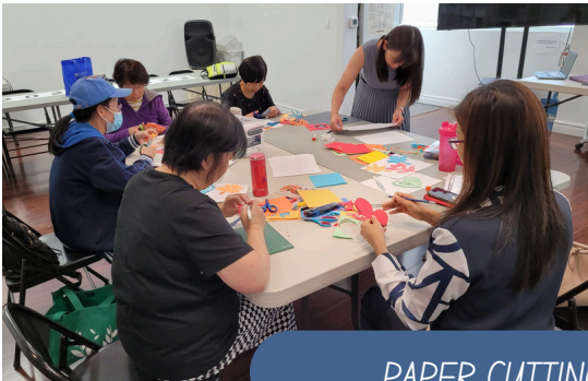
PAPER CUTTING CLASS

IS.E.A.S. Centre received funding from the City of Markham's Celebrate Markham initiative to launch a seniors' club focused on exploring various art forms. Through this project, seniors had the opportunity to engage in creative activities such as paper cutting and other artistic crafts. In Fall 2023, we hosted a Paper Cutting Class, followed by a Creative Arts Class in Winter 2024. Both sessions were met with great enthusiasm, with over 50 participants taking part throughout the project. This initiative not only provided seniors with a platform to learn new skills but also fostered creativity, social connection, and community engagement.